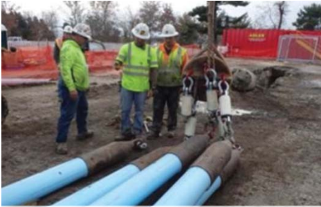
Southern Maryland Electric Cooperative Lexington Park, MD