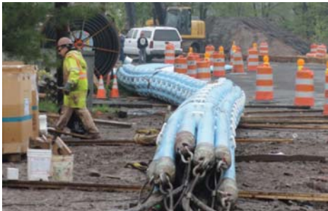
PSE&G Carlstadt, NJ