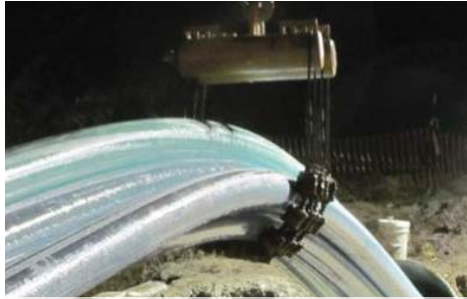
National Grid Malden, MA