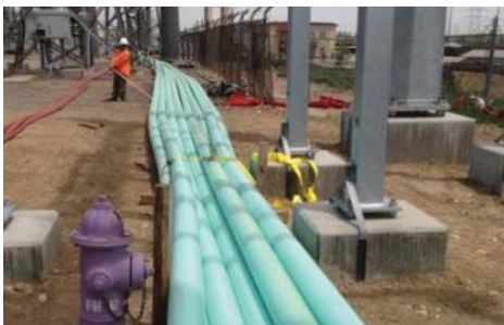
Cherokee Power Station Denver, CO