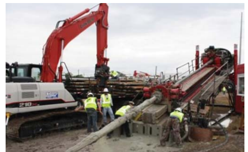
City of Corpus Christi Corpus Christi, TX

Underground Solutions, Inc. provides infrastructure technologies for power, water and wastewater applications. Underground Solutions®, Fusible PVC®, Fusible C-900®, Fusible C-905®, and FPVC® are trademarks of Underground Solutions, Inc. are trademarks of Aegion Corporation and its affiliates.