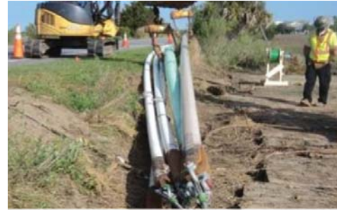
Town of Folly Beach Folly Beach, SC