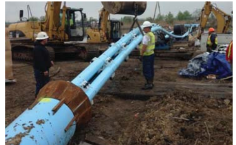
Woodbridge Energy Center Woodbridge, NJ