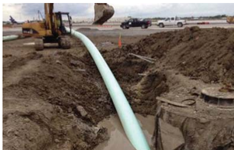
Detroit Metropolitan Wayne County Airport Detroit, MI