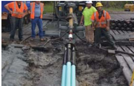
Tideland Electric Cooperative Bellhaven, NC