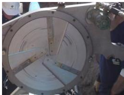
The fusion machine's dual cutting heads face and square both ends of the PVC pipe simultaneously.