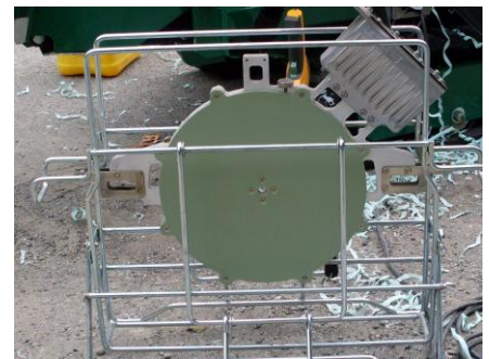
An electronically controlled heating element heats the ends of the pipe, forming a bead of fusible material.