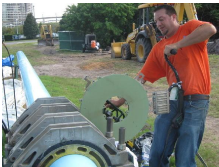
After the pipe ends have been heated, allowing proper bead formation, the heater plate is removed, and the pipe ends are brought together quickly.