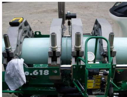
The joined pipe segments are held under pressure until the newly-formed joint cools sufficiently to ensure strength.