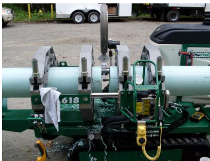
Pipe ends are precisely and securely aligned in the fusion machine.

Fusible C-900®, Fusible C-905® and FPVC™ pipe systems have distinctive properties which allow for full strength butt fusion joints. While other thermoplastic materials have been fused routinely, UGSI's fusion process incorporates a proprietary PVC formulation and a unique combination of heat, pressure and time that results in fully pressure rated butt fusion joints. UGSI holds the worldwide patents on PVC butt fusion.